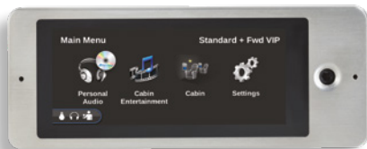
Touchscreen switch panel

Touchscreen switch panel – With optimized design for installation and usage near your seat, our touchscreen switch panel provides comprehensive seat and cabin controls. It incorporates state-of-the-art technology, dynamically supports VIP and standard configurations, and can default to a flight status display when not in use. Bezels are plateable to match your unique cabin interior.