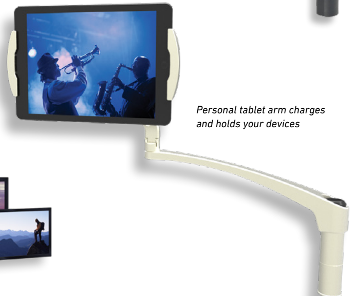
Personal tablet arm charges and holds your devices