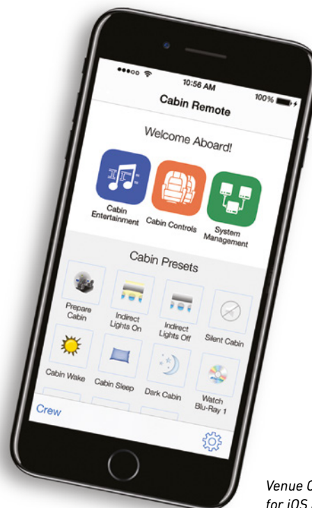
Venue Cabin Remote app for iOS and Android devices