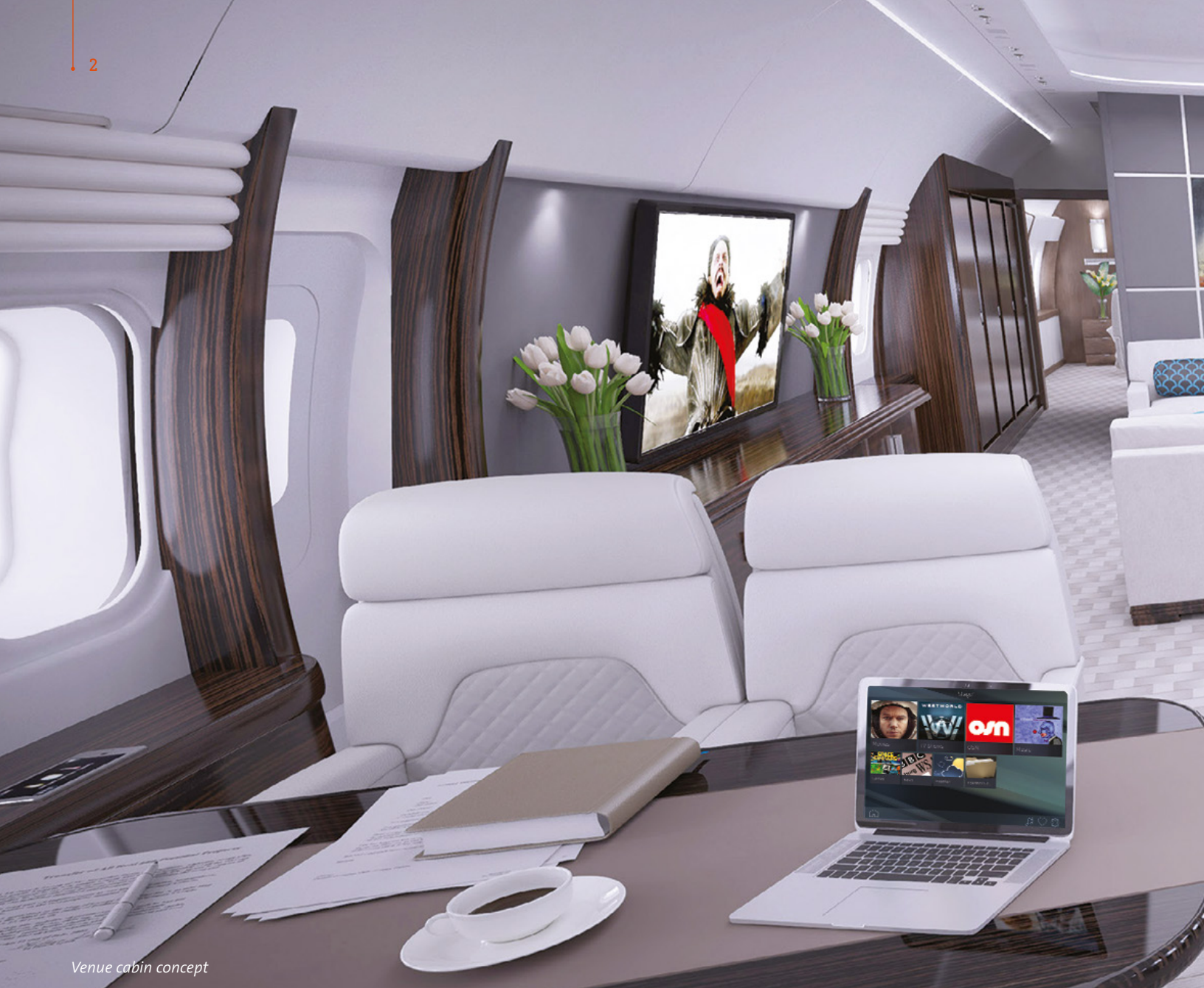
Venue cabin concept

UPGRADE YOUR CABIN EXPERIENCE TO THE NEXT LEVEL