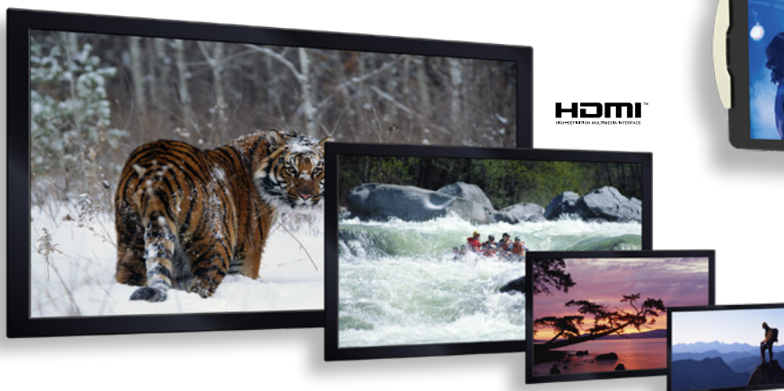
Choose from 24-, 42- and 65-inch high-definition bulkhead displays or cabin-wide 4K displays in sizes from 15 to 75 inches