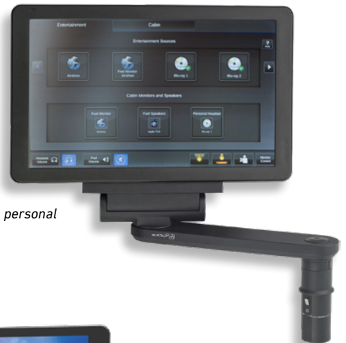
10.6-inch HD personal touchscreen

Venue is designed to support exciting new consumer technologies as they emerge.